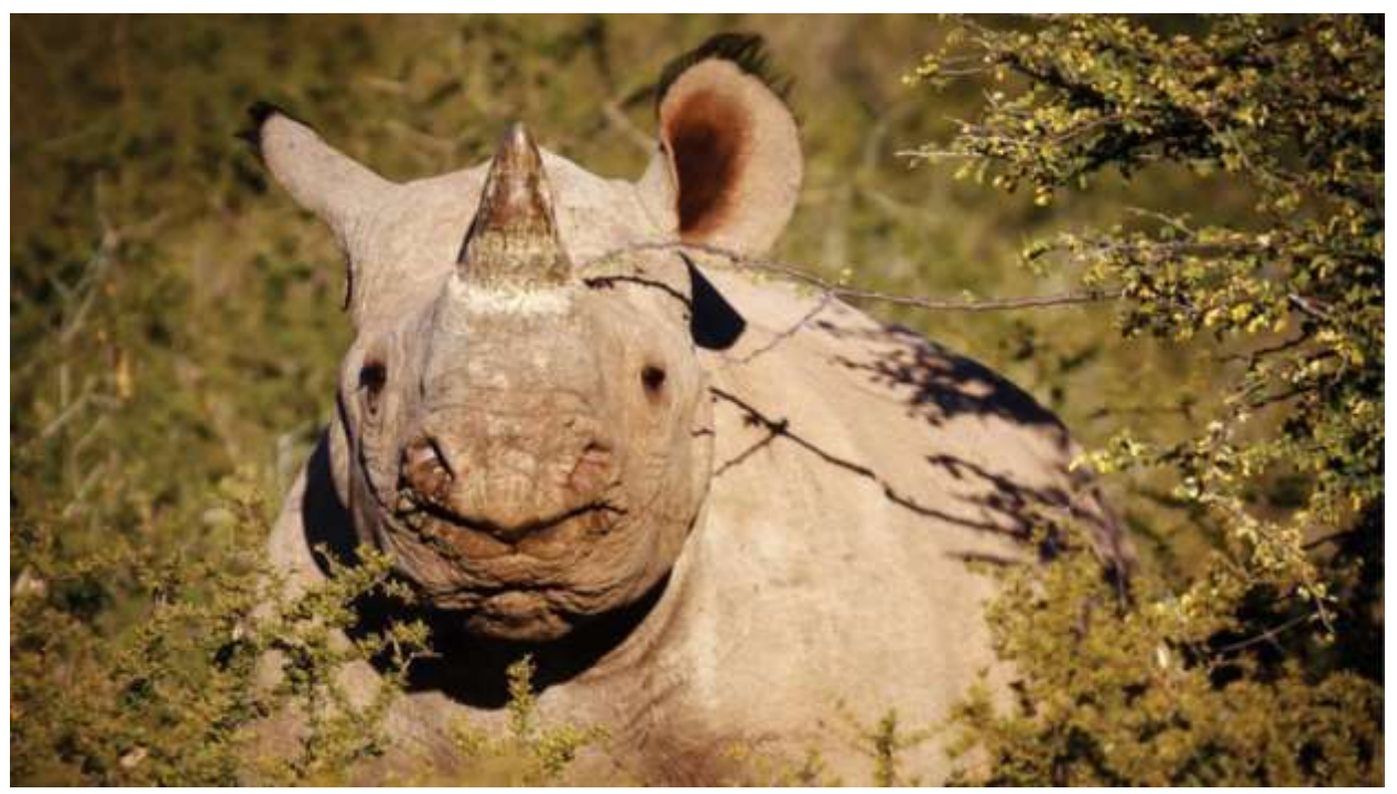
"Big Five" game viewing in South Africa's Private Game Reserves

12-Day South African 'Big Five' Safari & Cape Highlights - Option 3 - Tanda Tula + MalaMala