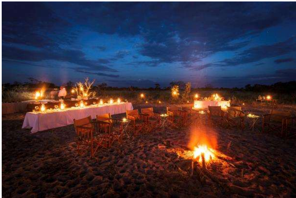
Dinner under the stars in Botswana's Okavango Delta