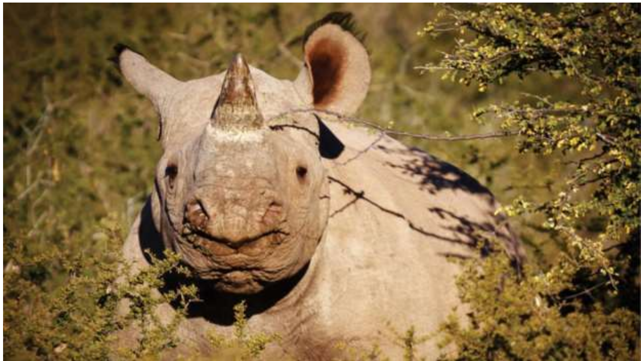
“Big Five” game viewing in South Africa’s Private Game Reserves

12-Day South African 'Big Five' Safari & Cape Highlights - Option 3 - Tanda Tula + MalaMala