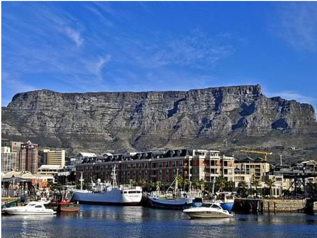
Waterfront with Table Mountain in background