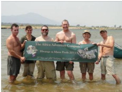
Swimming in Lower Zambezi

We spent two days on the river with a combination of walks and fishing. Who knew I was a fisherman supplying breem (tilapia) for the appetizer at dinner one evening. We stopped to swim in the river, play tennis ball with an ore enjoying the cold water on a hot hot day. Brunch was served on day one, a full English breakfast cooked over a camp fire by learner guides Tan and Dani, along with fresh salads and breads. Day two was salads and pizza.