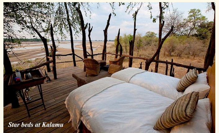
Star beds at Kalamu

Visit the AAC BLOG! Our exciting website features a variety of our safari programs as well as updated staff and client trip reports plus the latest in what's happening within the African Safari Industry under "Bush Tails".