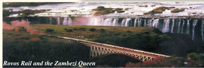
Rovos Rail and the Zambezi Queen