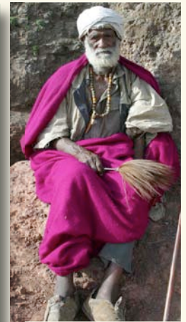
Lalibela in Ethiopia

South Africa Royal Travel on Rovos Rail and the Zambezi Queen Lemurs surfing in Madagascar Pyramids and Petra - the jewel and the crown A Moroccan sleep out - Bedouin tents in the Atlas Mountains A Date with the Coco de Mer Palm - Glamour in the Seychelles Ethiopia - walking the spiritual path Mozambique - Africa's Eden in Gorongosa Zimbabwe for the Zambezi - canoeing in Mana Pools Namibia - cycling through Damaraland Botswana - the Wilderness Waterways Zambia - star beds at Kalamu Uganda & Rwanda - Ape Escape Tanzania - the great beast retreat to the Selous Kenya - an Enchanted African Experience at Lemartis