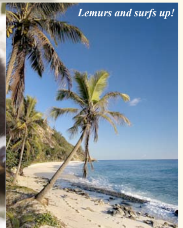
Lemurs and surfs up!