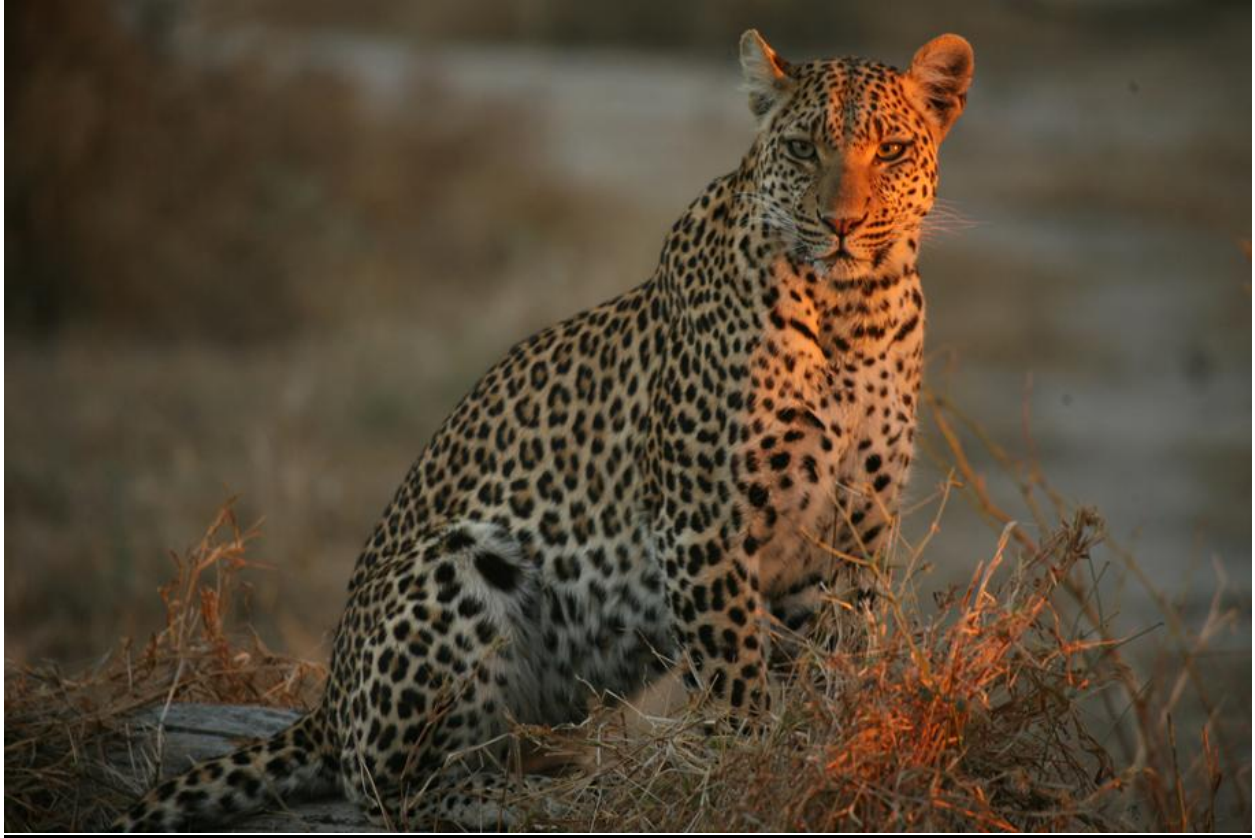
Legodima and her two cubs – a female and male

Found Legodima in the early morning light sitting under a tree quite near camp. Then Cisco picked up another male leopard in a tree with a kill. As we watched him a 3 rd male leopard came into the picture who he thought was the father of the two cubs. We got a few nice pictures of him before we looked for the cubs – a female and male and what a treat to view them. Can you believe we saw 5 leopard s within an hour all in a very small area? We spent a delightful few hours working our way around the various sightings.