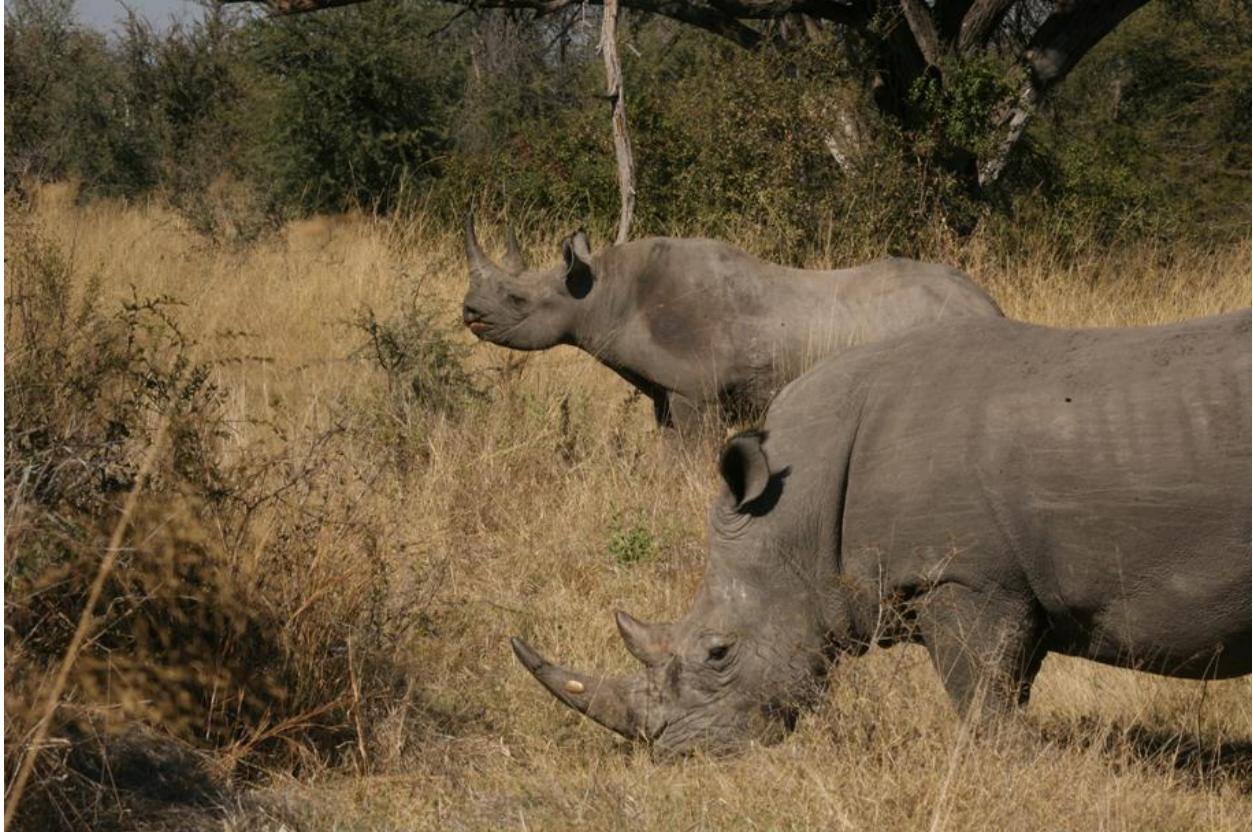
The black rhino in the background is a browser, the white rhino in front is the grazer

Poster (the Save the Rhino guy) came on the radio - he had found two rhino so headed on a long drive north. Got our Big Six sighting- both a black female and a white male rhino together - very rare!!