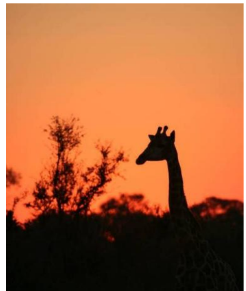
Vumbura Plains - North camp – perfect spot for sunrise sightings