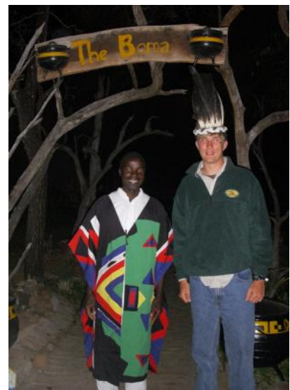
Afternoon and evening fun in Victoria Falls