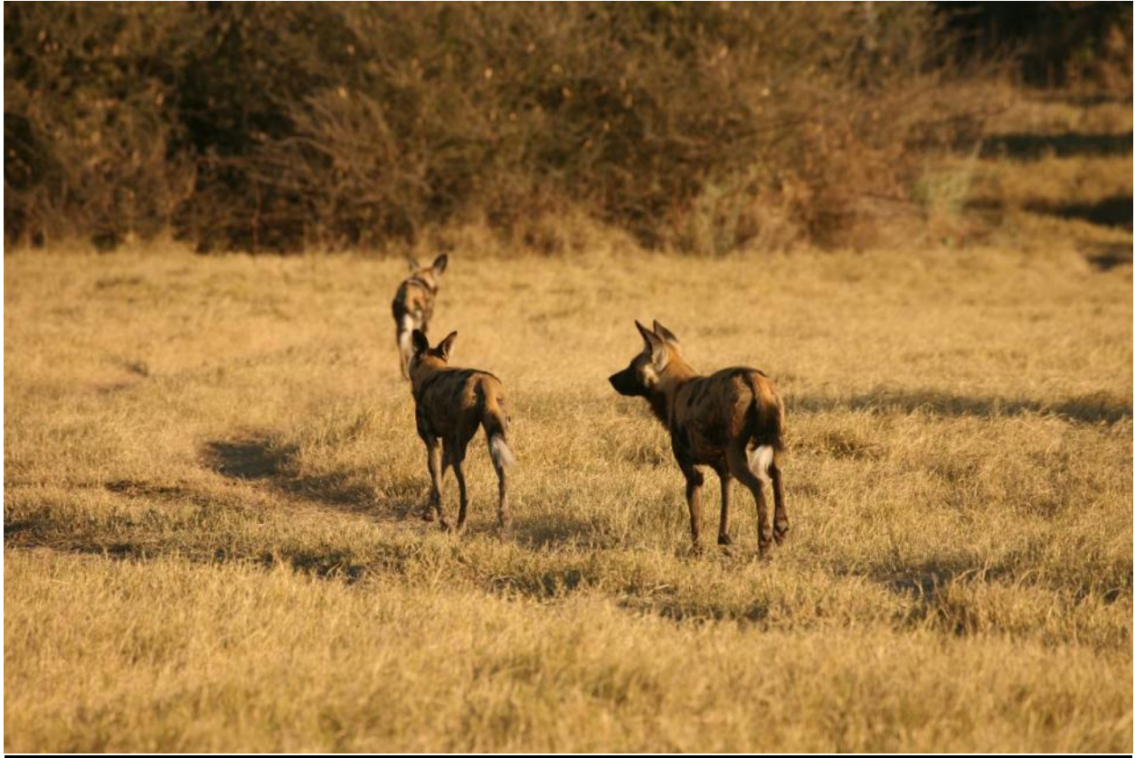
The three wild dogs were such a treat to see