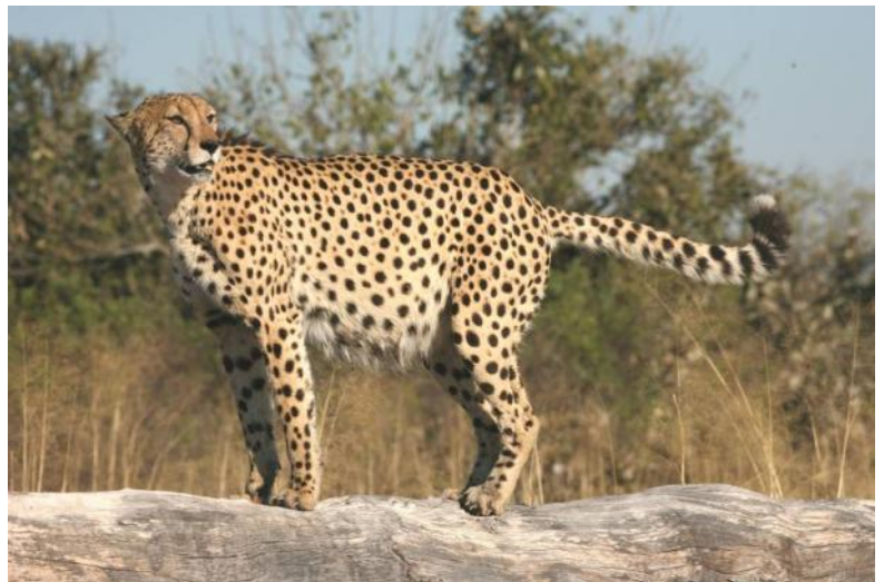
Fabulous cheetah sighting – we followed him for half the morning !