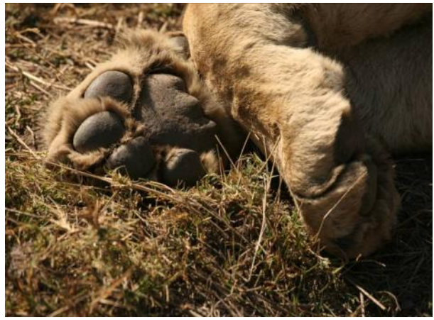
The lion and the culprit of all those tracks!