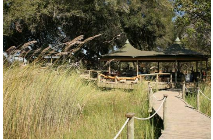
Little Vumbura setting – only takes 12 guests and has a family unit