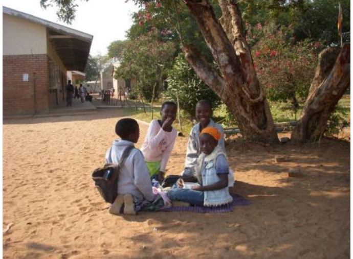
A week after the elections and the local kids were happily attending school at Chamabonda