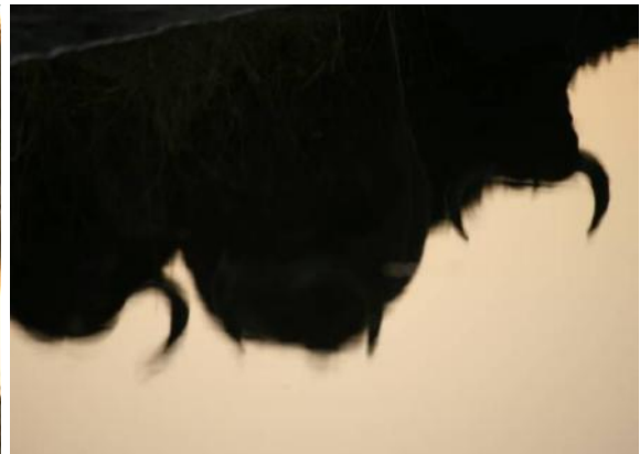
First day sightings at Vumbura