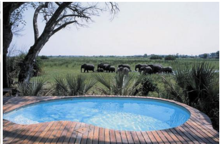
Little Mombo setting