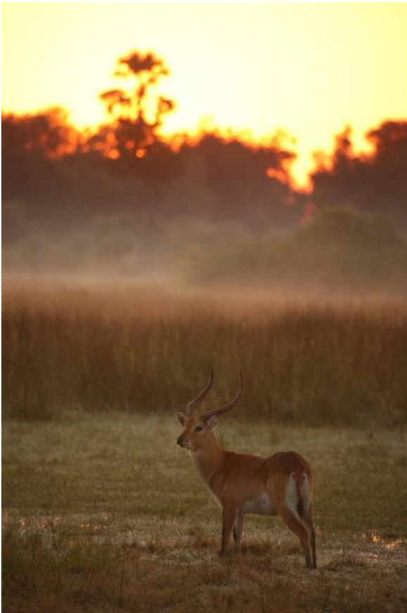
Early morning sighting leaving camp

Up early as Cisco wanted to continue the tracking of the lion so headed over to the rhino boma where he had picked up the tracks yesterday. Drove for 7 hours tracking ... to Lechwe Heaven and traversed along an entire river line. Saw many, many lion tracks of all sizes, hungry vultures in trees, zebra grazing peacefully, kudu grazing peacefully, lechwe grazing peacefully - and no sign of lion. With the sun high in the sky we headed home tired but having enjoyed a morning of tracking. There was a reward as we found the two males of the pride lying up as we headed back to camp. Nat our tireless manager had late brunch waiting and new visitor, Grant Woodrow who heads up the whole Botswana Wilderness operation.