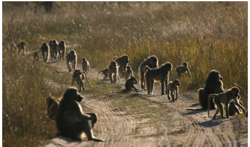
Other sightings on the game drives