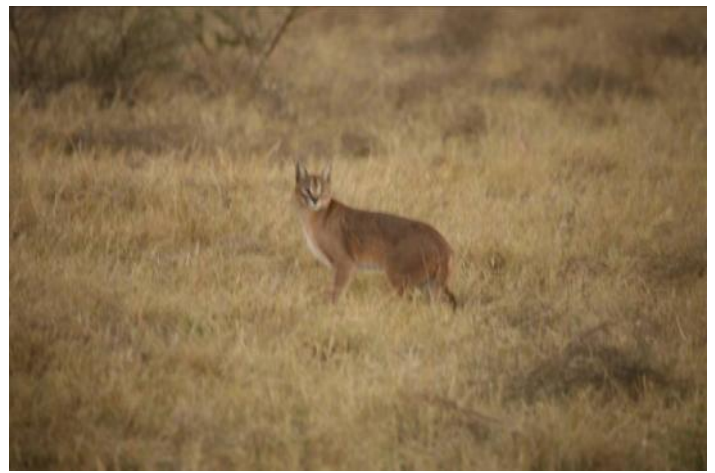
Late afternoon light and the continuing Mombo mini -documentary with sightings of a cheetah and caracal