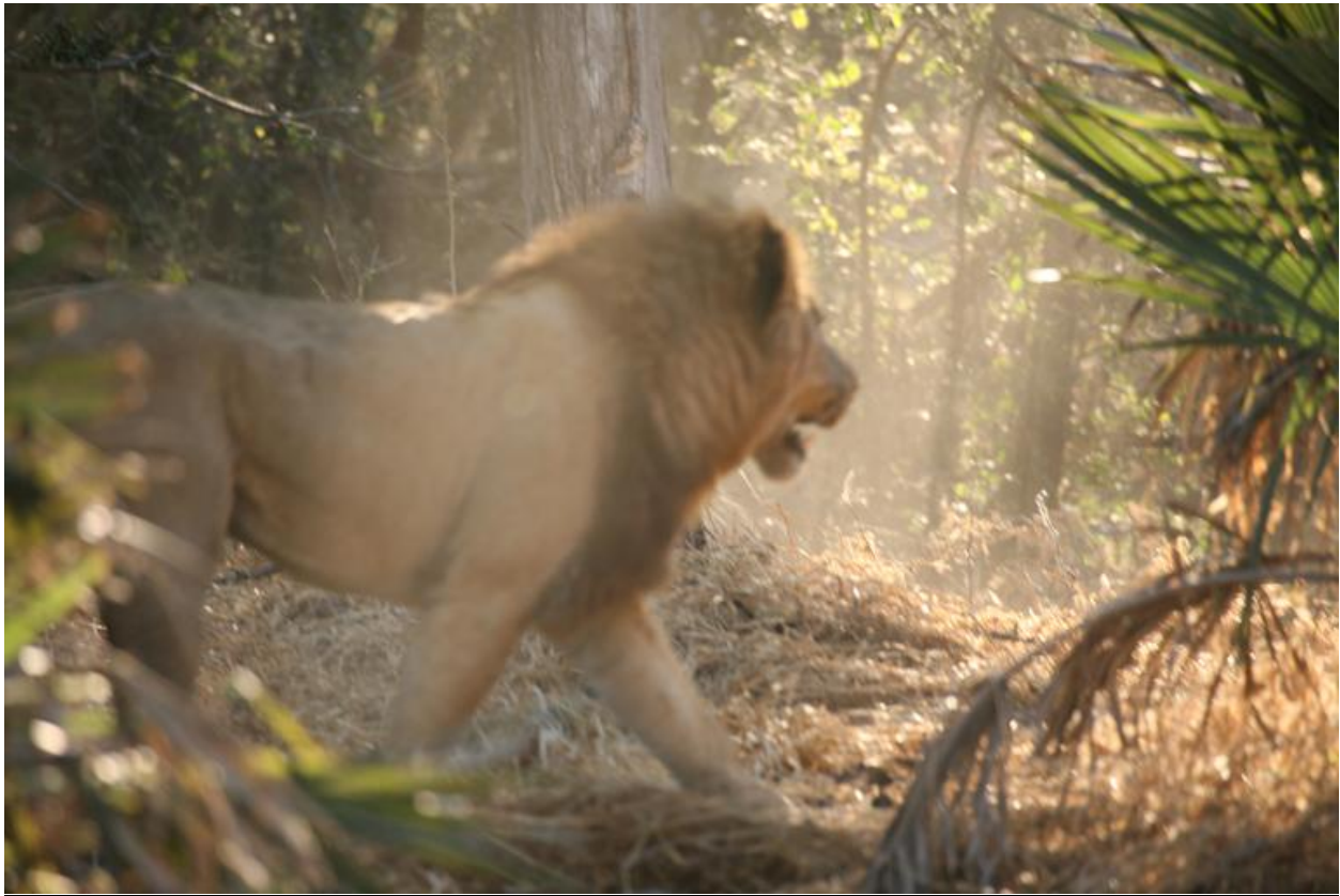
The lion hunt